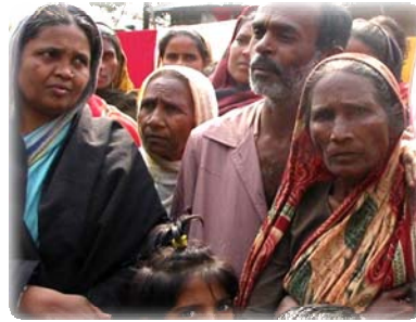
Self Empowered small business owners- Syedpur Camp