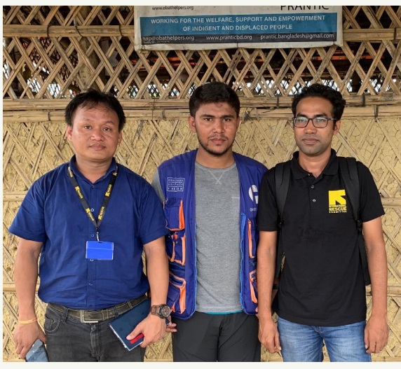
Team from International Rescue Committee