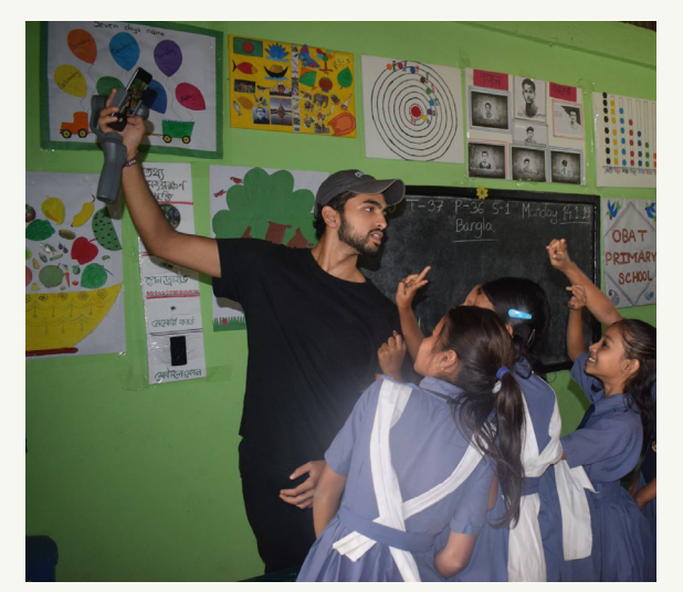
Mohammad Malick- Photographer