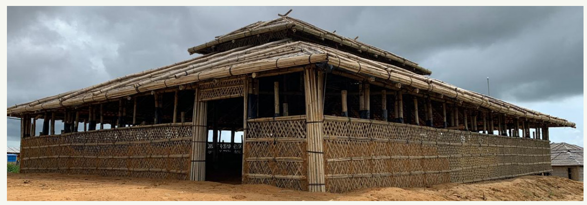
Community Center Reconstructed

inflicted serious damage to both centers. In July, OBAT began this reconstruction, and this month the construction of both community centers was completed! Community Center 2 will now serve as a much-needed Youth Adolescent Center in camp 4.