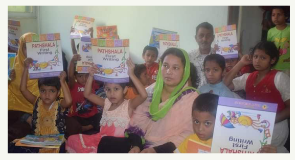
A preschool class

Two new preschools were established in the Raufabad area in Chittagong. Forty children were enrolled in these preschools.