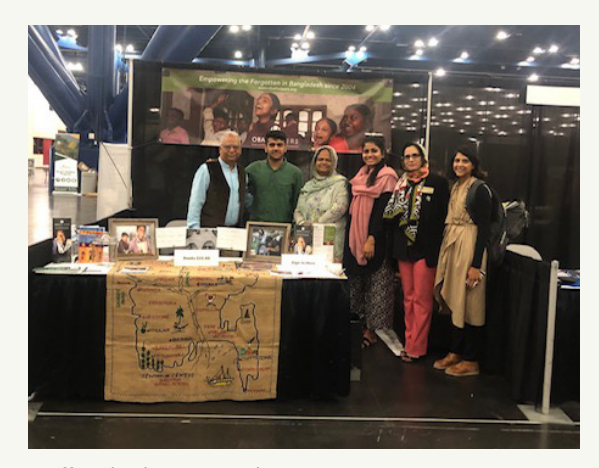
Staff and volunteers at the ISNA convention

The 2019 ISNA Convention was chock full of activities for OBAT. The staff and volunteers usually meet many new and old friends through the organization's booth. This time, a lucky person who entered a drawing at the booth, also won a gift card. OBAT also hosted a meet and greet event. Thank you to all the guests who attended this informative event, which included many interesting features such as open discussions, a panel discussion of visitors to OBAT's programs and a scavenger hunt as well.