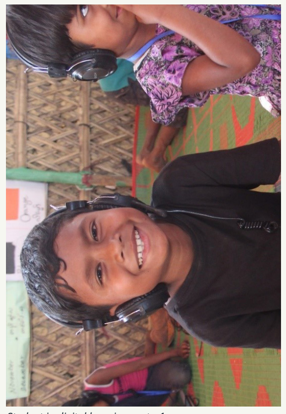
Student in digital learning center1

OBAT is excited to work towards making Digital Learning available to all its Learning Centers. In 2019, digital learning was introduced to TLC 4. Facilitators have seen attitude boosts towards learning, and students are enthusiastic about using tablet based apps.