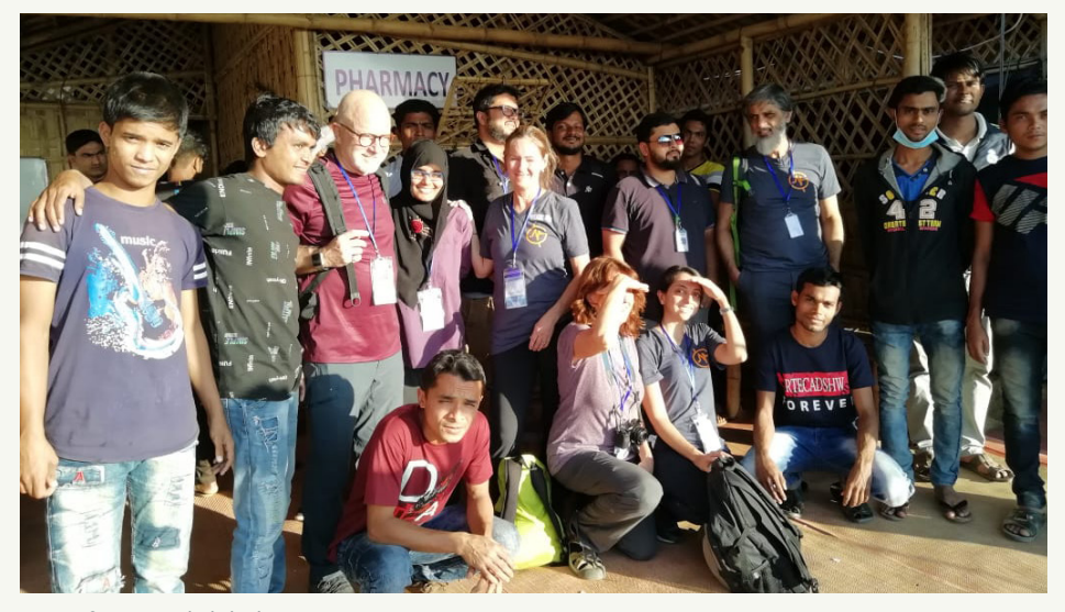
Team from MedGlobal