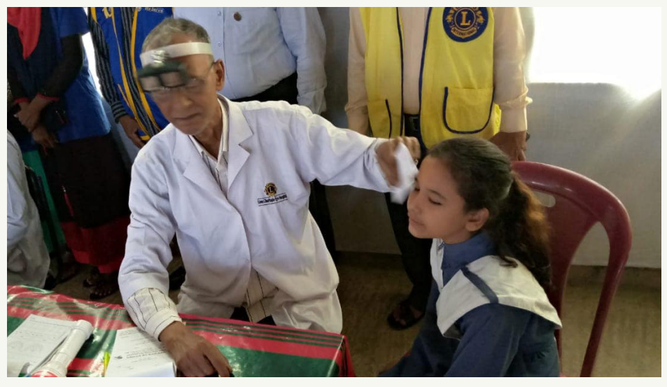
Vision Screening by Lions Club of Chittagong