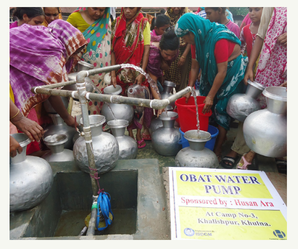
New water pump at Khulna