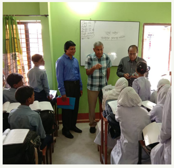
Friends of Humanity USA at OBAT's Syedpur School