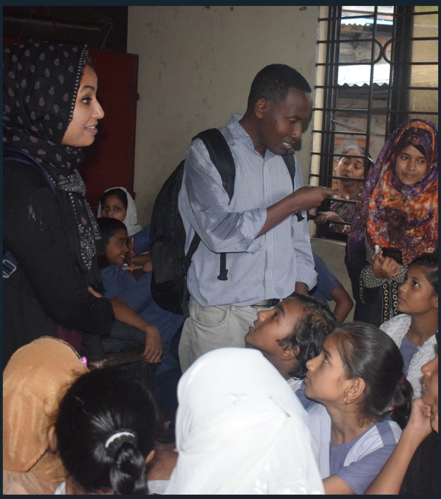
Team from American Refugee Committee