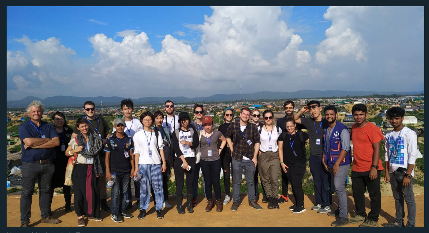
Harvard University's Team