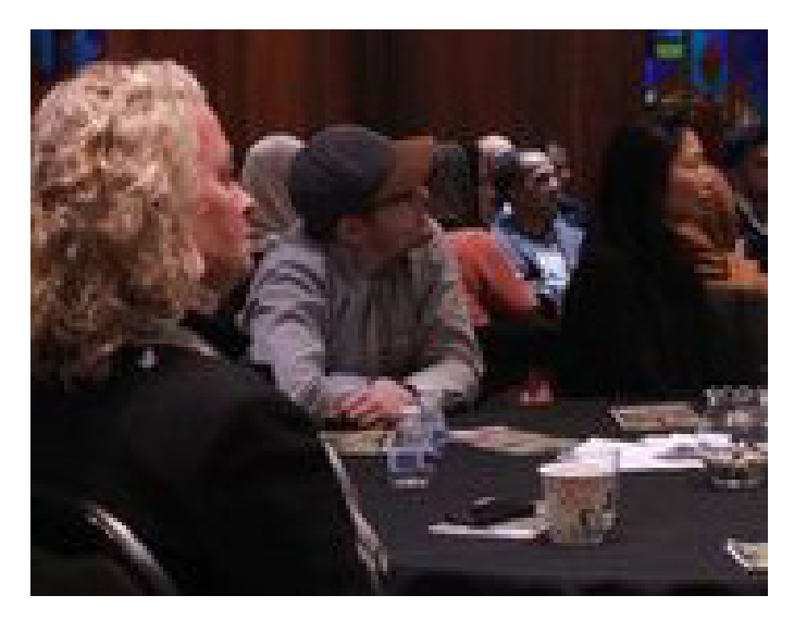
OBAT's supporters in Indianapolis gathered at the Indiana Interchurch Center for the program, "Support the Rohingya." The program's purpose was to spread awareness and raise funds for the Rohingya crisis.