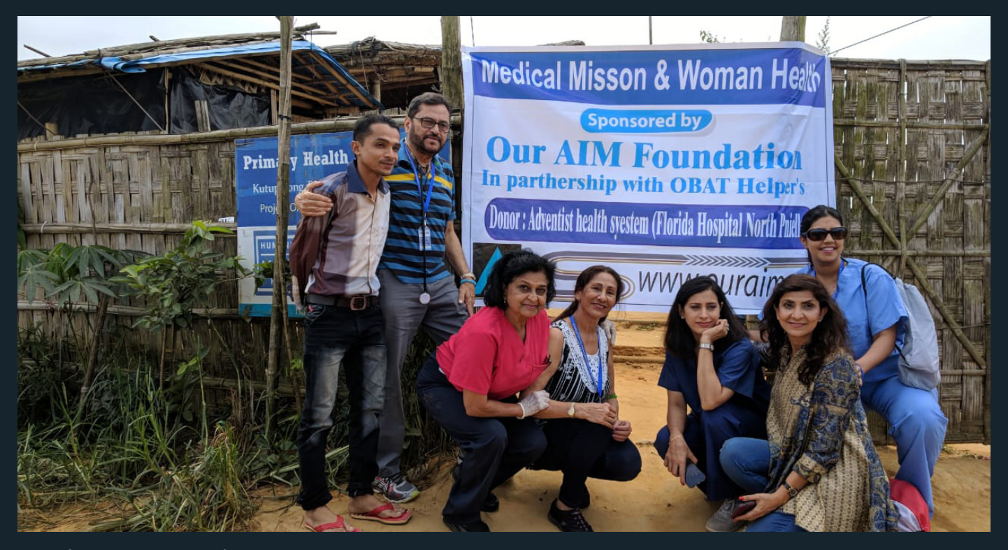
Team from Our Aim Foundation