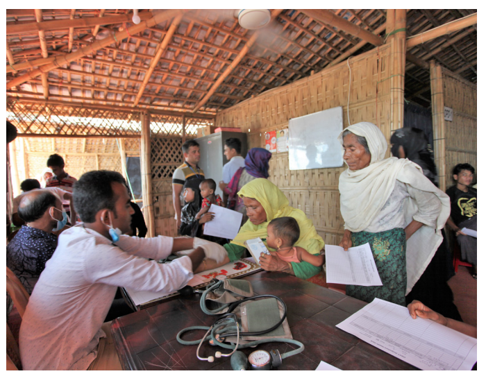
A second clinic for Rohingya refugees went into operation on May 20th. This clinic's objective was to accommodate the growing demand for medical facilities in the Rohingya camp. The new clinic offers both hospital inpatient and outpatient care.