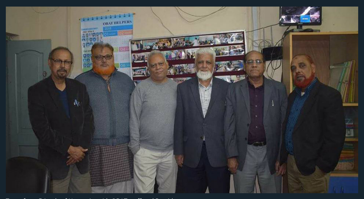
Team from Friends of Humanity with OBAT staff and President