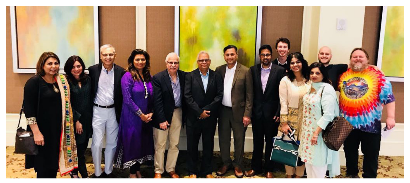
The DOGANA (DOW Medical School Graduates' Association of North America) retreat held in Los Angeles on April 1st, included a "Brunch for a Cause" in support of OBAT.

We are deeply thankful to DOGANA for organizing this event for OBAT and for spreading the word about its humanitarian work.