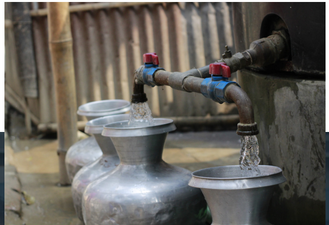
INFRASTRUCTURE DEVELOPMENT AND RELIEF