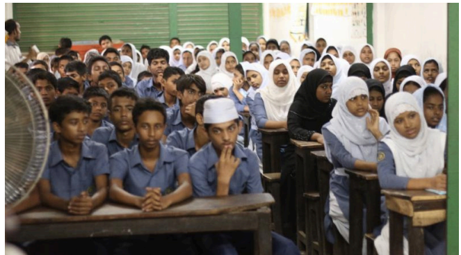
Above: A class at NLJ High School

Previously, OBAT operated grade sixth through eighth of NLJ High School while PLAN Bangladesh, another NGO, managed the kindergarten class through grade five. With the phase out of PLAN's support, OBAT has now assumed the financial responsibility of the grades previously supported by PLAN. It has also added ninth grade to the school. OBAT's SB Nagar School in Chittagong is now conducting grade six classes as well. The school formerly taught elementary (1st to fifth) grades. Grade six was also added to OBAT's English School in Dhaka.